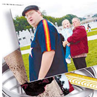
As digital cameras take hold, will our boxes of baby, vacation and prom pics disappear?

There's one in almost every American household: a shoebox stuffed with faded snapshots of days gone by, the kids' baby pictures, the ugly dress you wore to the prom, innumerable views of the Grand Canyon, the college roommate passed out drunk. Americans have been filling such shoeboxes for generations, and now, thanks to the delete button on digital cameras, this widespread custom is coming to an end.